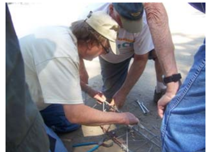
Friday setup — it's all about antennas